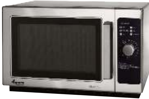
Model RCS10DS shown