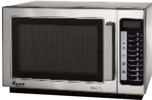
Model RCS10TS shown